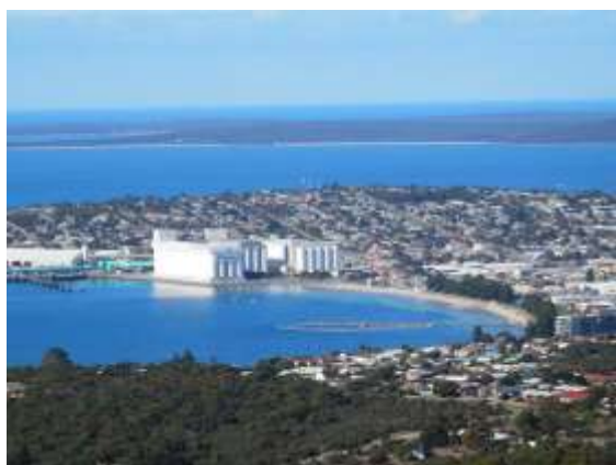
View of Port Lincoln where the silos dominate – an important structure serving a busy port and the agricultural industry of Eyre Peninsula.