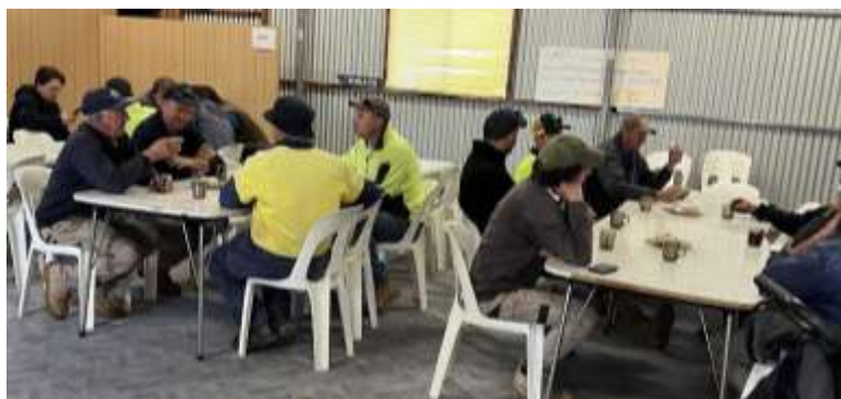
Cunliffe WAB members preparing lunch for the men from YP Agricultural Bureaux, all busy getting ready for the YP Field Days.