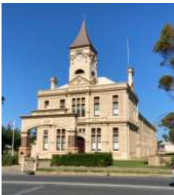
Wallaroo Soldiers Memorial Town Hall, One of the well maintained Town Halls in the Copper Triangle.

Following on from the last two newsletters when branches were ‘placed on a map’ and then a short description of industry and agriculture of their area, this time we are featuring a prominent building, statue or other distinctive feature in their locality.