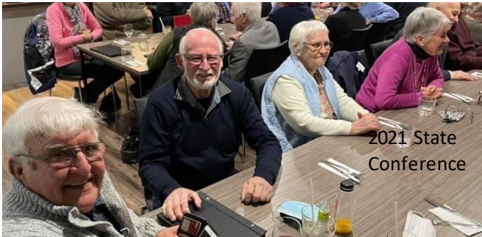
2021 State Conference