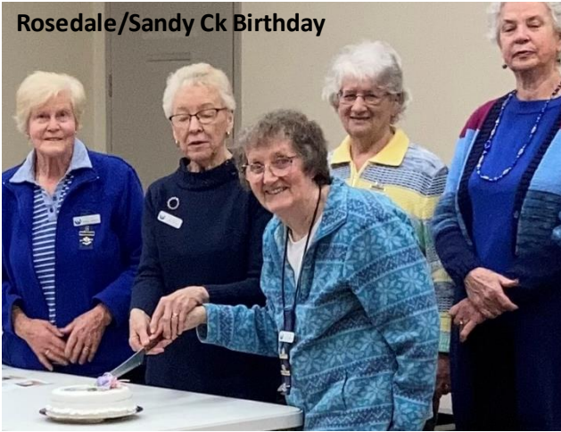
Rosedale/Sandy Ck Birthday