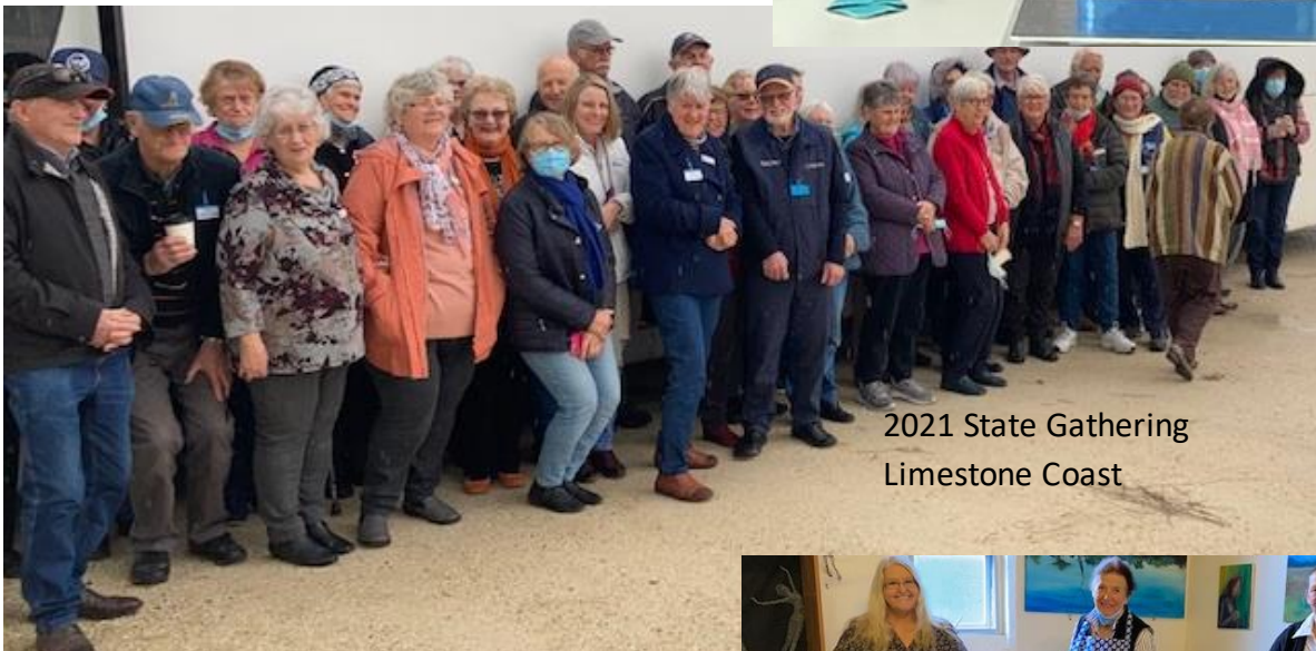
2021 State Gathering Limestone Coast