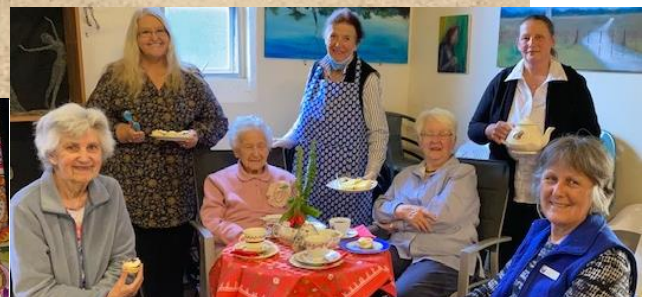
Scone Day Kalangadoo