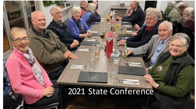
2021 State Conference