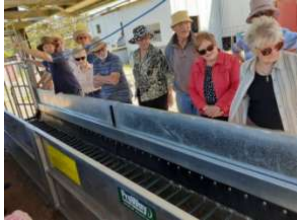
The sheep went that way!

On-Line: Our membership continues to expand and some of us met in Tanunda in September for High Tea at Wohlers. Go to WAB's Face book page for photos posted by Sally.